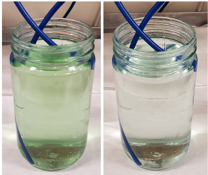
Before: “Raw” wastewater contained 701 ppm copper.